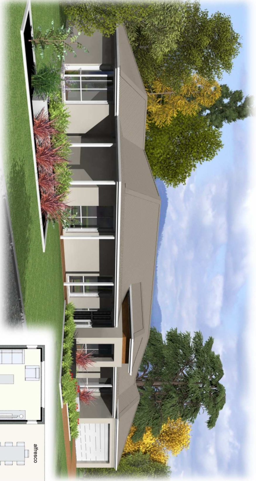
Artist impression only, actual plans may vary slightly